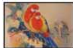
"Eastern Parrot" - Watercolor - Daphne Schmidt

Narrabri Antiques & Art Invites you & your friends to an exhibition featuring